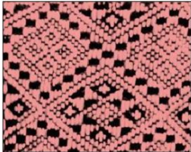
Textile of Ilocos

Can you identify the similarities and differences of the textile of Ilocos from the textile of Cordillera Province? How about the textile of Cagayan Valley from the textile of Mountain Province? Compare and contrast the types of textile according to their patterns, designs, colors, and material used.