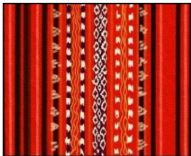
Textile of Cagayan Valley