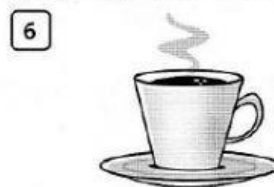
glass of milk / cup of coffee