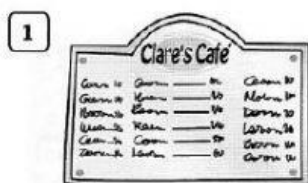
uniform / menu