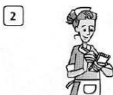
waitress / customer