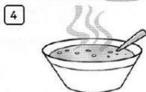
bowl of soup / plate of salad