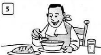
waiter / customer