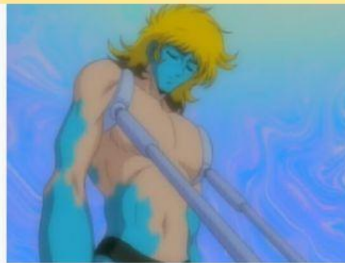
#DaftPunk #HarderBetterFaster #Video Daft Punk - Harder Better Faster (Official Video)