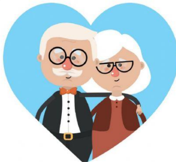
Grandma and Grandpa

Together with my family, we have _____dog, Bones. It _____the best pet ever!