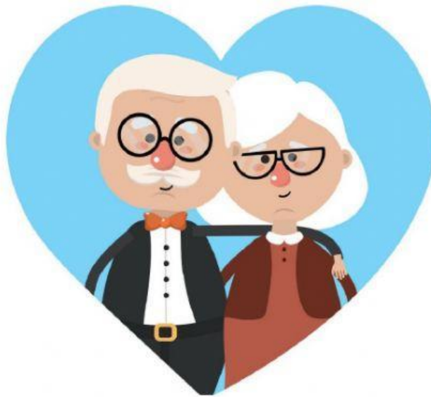
Grandma and Grandpa

Together with my family, we have _____dog, Bones. It _____the best pet ever!