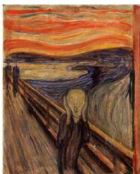
"The Scream" by Edvard Munch

1 _____ painting is beautiful, many artists had tried to replicate it but 2 _____ paintings are not as good as the original. In the front 3 _____ a man standing on a bridge. He 4 _____ he is screaming. His face is expressing surprise and fear. His mouth is open in an 'O' shape, his eyes are wide open and his hands are on his bald head. In the 5 _____, on the 6 _____, 7 _____ two people walking towards him but they don't look worried. The sky is blood red and under the bridge, 8 _____ a blue river.