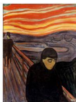
"Despair" by Edvard Munch