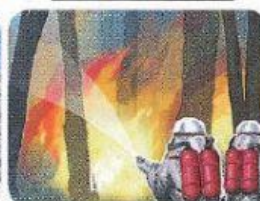
10 a _____

Complete the text with the words below. There is one extra word.