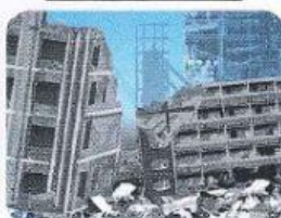
9 an _____