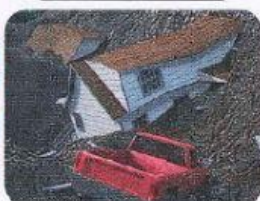
8 a _____