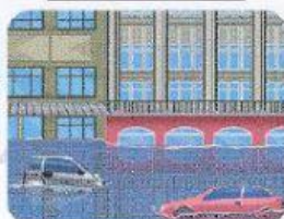
7 a _____