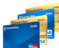
a credit card