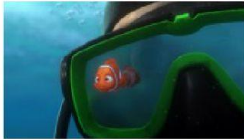
Nemo gets caught

Watch any hollywood movie and within the 15 minute mark, something will happen that will change the character's world! The hero then has to find a way to solve the problem.