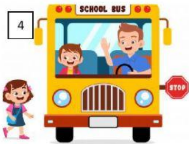
Sue goes to school at eight o'clock.