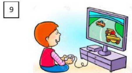
Tommy plays video games every day.