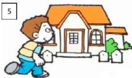
Joe goes home at five o'clock.