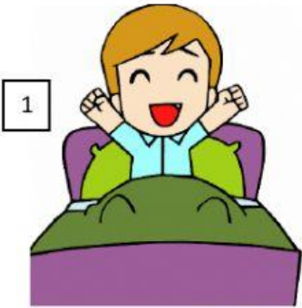
Sam gets up at eight o'clock.