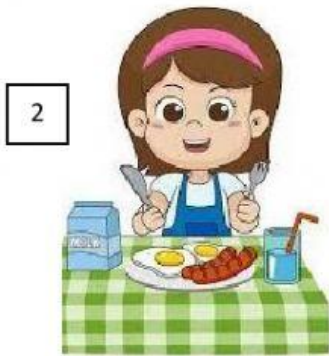
Nelly eats breakfast at nine o'clock.