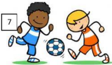
They play football after school.