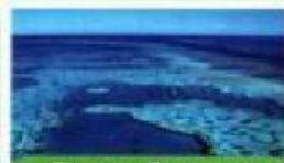
Great Barrier Reef

The Great Barrier Reef is in the sea off the coast of Australia. It's very big. You can see it from space!