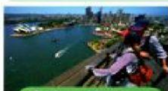
Sydney Harbour Bridge

Australia is the biggest island in the world. A lot of people in Australia live by the coast. They like surfing and going to the beach. Australians speak English. They sometimes call their country 'Oz'.