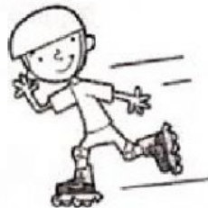
DANCE / ROLLERBLADE