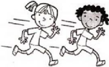
JUMP / RUN