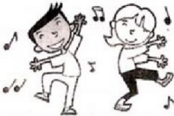
RIDE A BIKE / DANCE