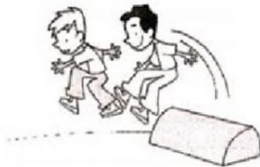
JUMP / ROLLERBLADE