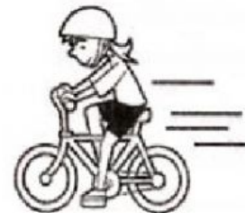
RUN / RIDE A BIKE