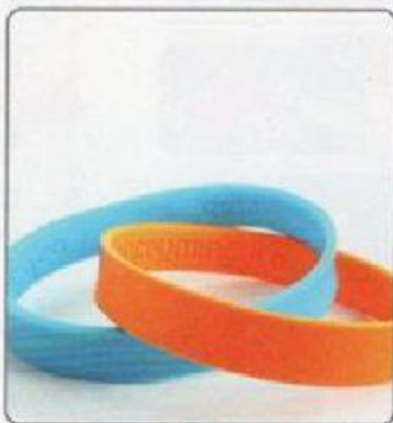
1 bracelets pulseras

bracelets clock cycle helmet hairbrush keys