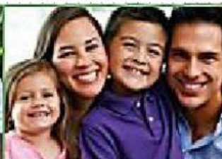
The Parra Family