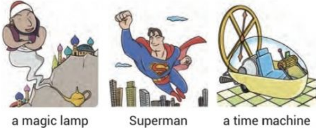
a magic lamp

In Context 그림의 상황을 가정하여 문장을 자유롭게 완성해 봅시다.