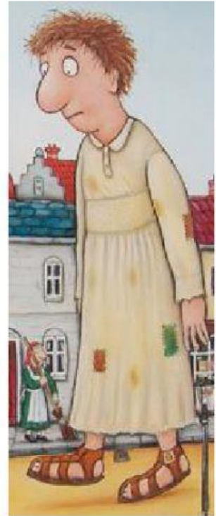
The Scruffiest Giant