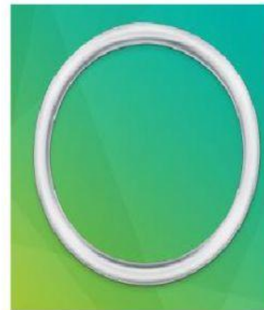
THE CONTRACEPTIVE RING- IMPLANT