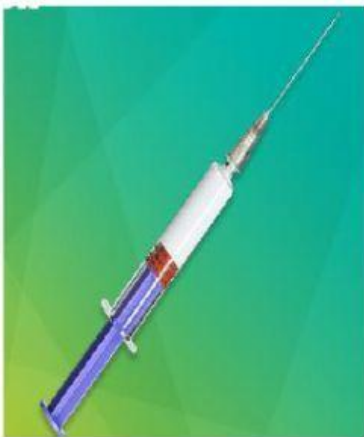
CONTRACEPTIVE INJECTION- PATCH