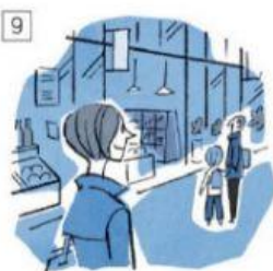
go shopping /gəʊ 'ʃɒpɪŋ/