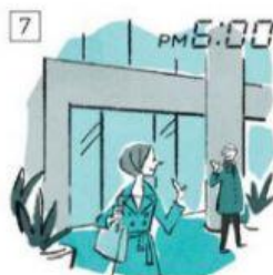
finish work /fɪnɪʃ 'wɜ:k/