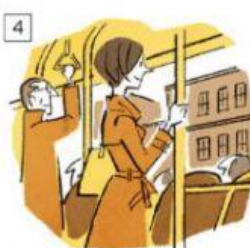
go to work /gəʊ tə 'wɜ:k/ (by bus, train, car, etc.)