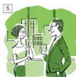
have a coffee /hæv ə 'kɒfi/