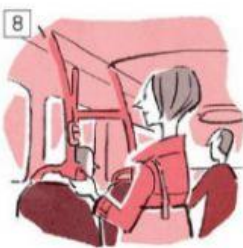
go home /gəʊ 'həʊm/