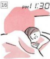
go to bed /gəʊ tə 'bed/