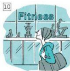
go to the gym /gəʊ tə ðə 'dʒɪm/