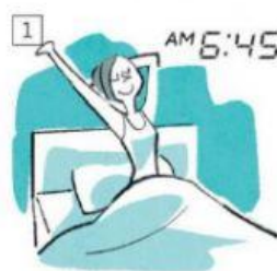
get up /get 'ʌp/