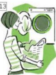
do housework /du 'haʊswɜ:k/