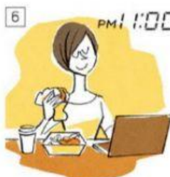
have lunch /hæv 'lʌntʃ/