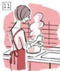
make dinner /meɪk 'dɪnə/