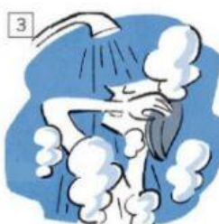
have a shower /hæv ə 'ʃaʊə/