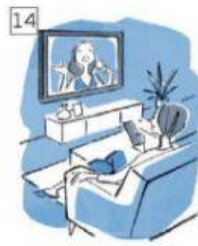
watch TV /wɒtʃ ti: 'vi:/