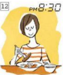
have dinner /hæv 'dɪnə/