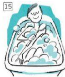
have a bath /hæv ə 'bɑ:θ/