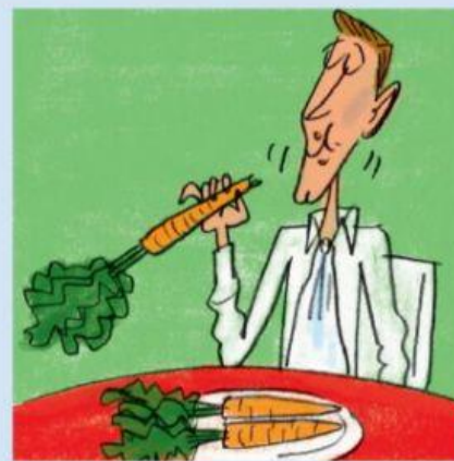
He never eats meat.