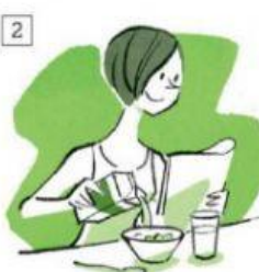
have breakfast /hæv 'brekfəst/