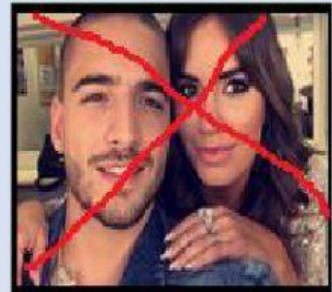
Maluma and Lali