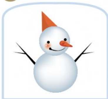
xuě rén snow man