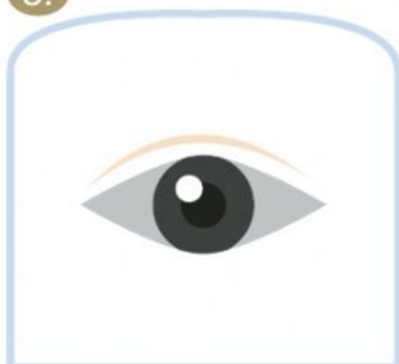
yǎn jīng eye