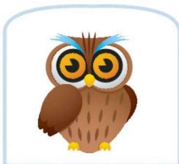
māo tóu yīng owl