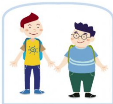
tóng xué classmate