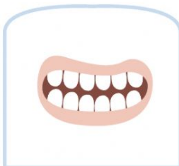
yá chǐ tooth