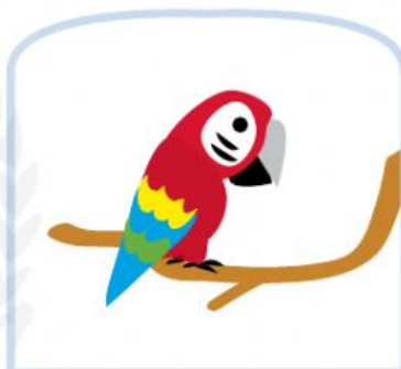
yīng wǔ parrot