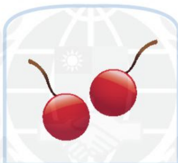
yīng táo cherry