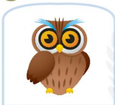
māo tóu yīng owl