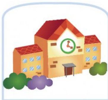
xué xiào school