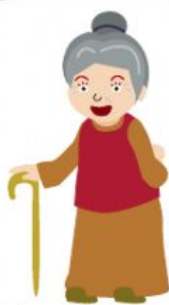
grandmother (father's side) nǎi nai