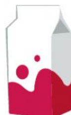
milk niú nǎi