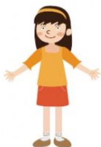
older sister jiě jie