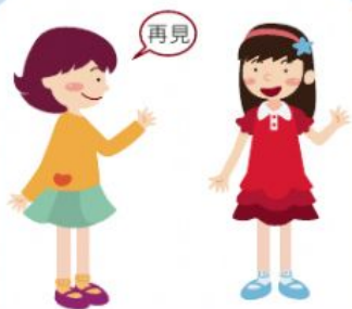
goodbye zài jiàn