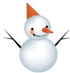
snow man xuě rén