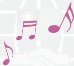
music yīn yuè