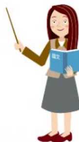
teacher lǎo shī