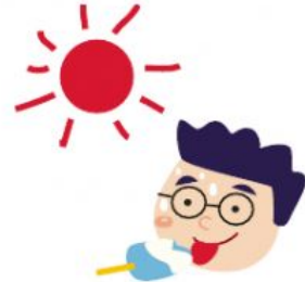
hot; warm rè