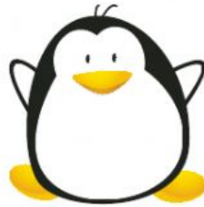
penguin qì é