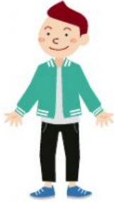
older brother gē ge