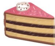
cake dàn gāo