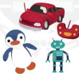
toy(s) wán jù