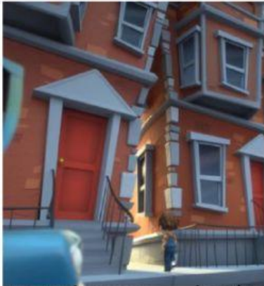
new house---- be (verb)