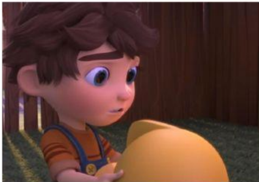
boy ----- see/ find (verb).