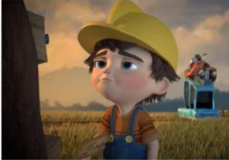
sad----- move (verb)

Let's take a look at the correct order of our story. What happens in each picture? Write sentences about the story using the words below each image.