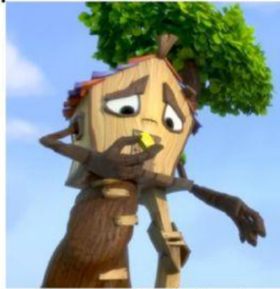
sad----- look for (verb)