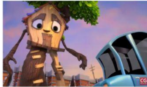
Tree house----- see/ find (v)