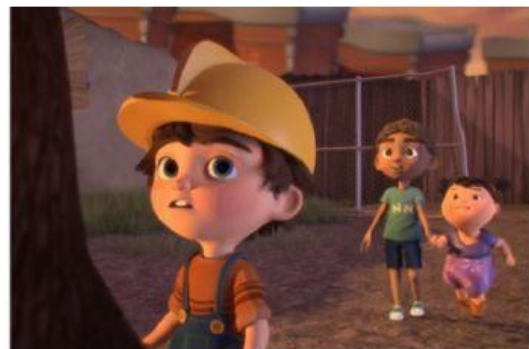
new friends----- play (v)