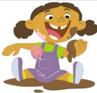
Playing in the dirt.