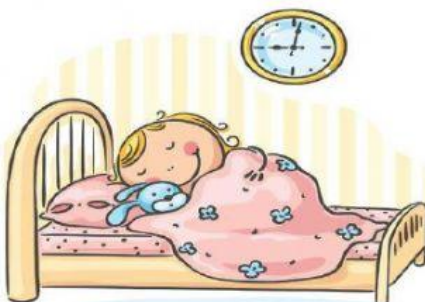
Going to sleep early.