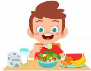
Eating a balanced meal.