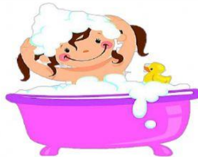
Taking a bath regularly.