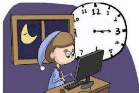
Staying up late.