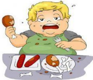
Only eating junk food.