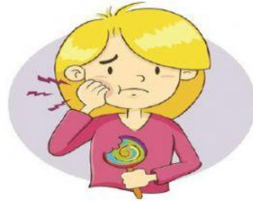
Eating too much candy.