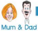
Mum &amp; Dad