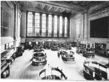
the New York stock exchange, 1935

Hetty _____ (make) her money on the New York stock exchange. She _____ (be) a financial genius. She _____ (make) money so easily that people _____ (call) her the Witch of Wall Street. But although she (be) one of the richest women in the world, she _____ (be) very mean . She _____ (count) every cent and she _____ (spend) as little as possible. She _____ (not own) a house because she _____ (not want) to pay property taxes. So she and her children _____ (live) in cheap hotels.