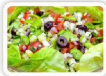
SOLTERO DE QUESO

Its ingredients are yucca, rice and chicken, wrapped in banana leaves. Some people like to drink chicha de jora when they eat this.