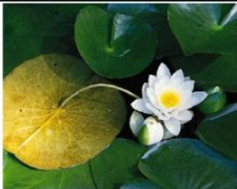
water lily - _____