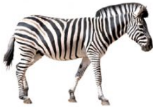
zebra - _____

Directions: Identify whether the living thing is an ANIMAL, a PLANT, a FUNGUS, or a MICRO-ORGANISM. Write your answer on the blank.