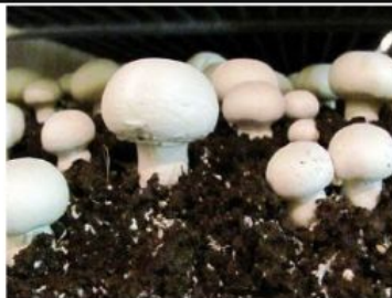
button mushroom - _____