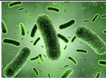
bacteria - _____