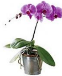
orchid - _____