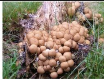
giant puff ball - _____