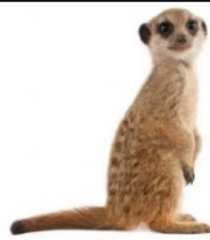
meerkat - _____