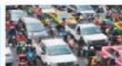
14 traffic _____