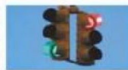
13 traffic _____