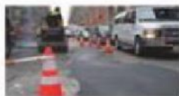
7 road _____