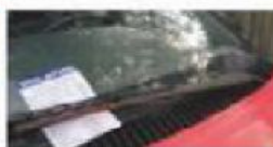
5 parking _____