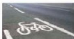
1 bicycle lane

Belt – Camera – Crash – Hour – Jam – Lane – Light – Limit – Stand – Station -- Ticket – Walk – Work -- Zone