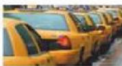
12 taxi _____