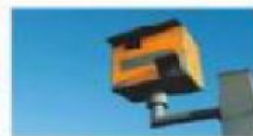
10 speed _____