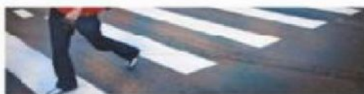
3 cross _____