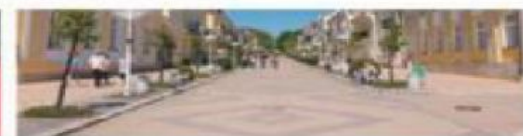
6 pedestrian _____