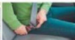
9 seat _____