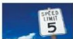
11 speed _____