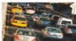
8 rush _____