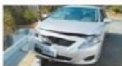
2 car _____