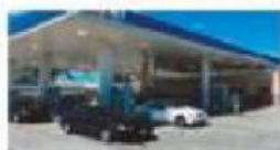
4 gas _____