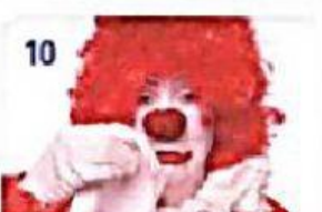
a sad clown