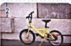
a small bike