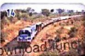
a slow train