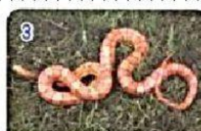
a long snake