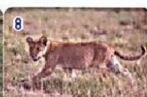
a young lion