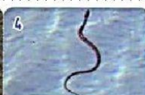
a short snake