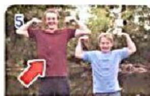
a tall boy