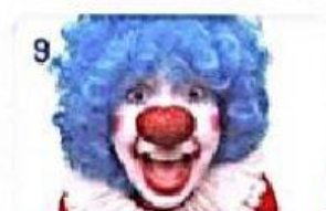
a happy clown