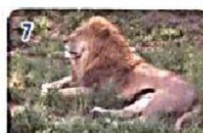
an old lion