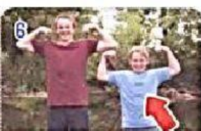
a short boy