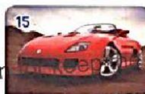
a new car