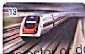
a fast train