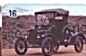
an old car