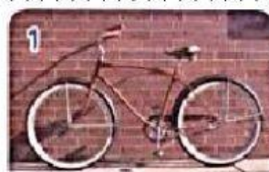
a big bike

Ex: Look at number 10. He's a sad clown. The clown is sad.