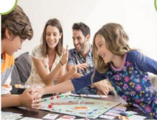
Playing board games

Check with a cross X the activities that you do with your family.