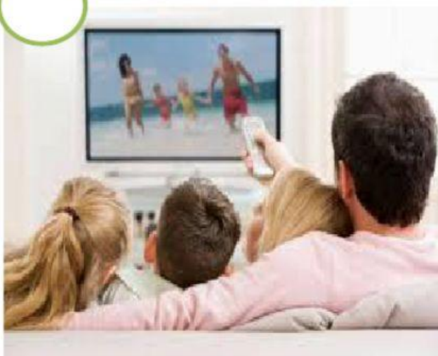
watching Tv or going to the cinema