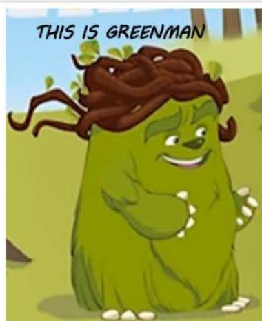
THIS IS GREENMAN

These are our new friends from the story: