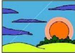
IN THE EVENING