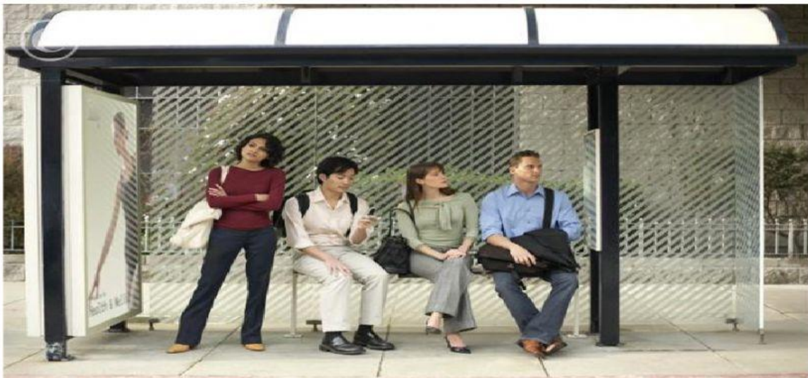
The bus / arrive