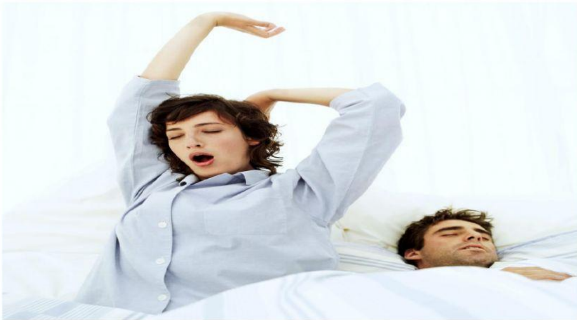
My mom / wake up