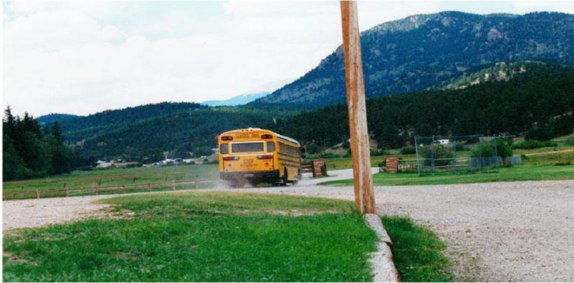
The bus / leave