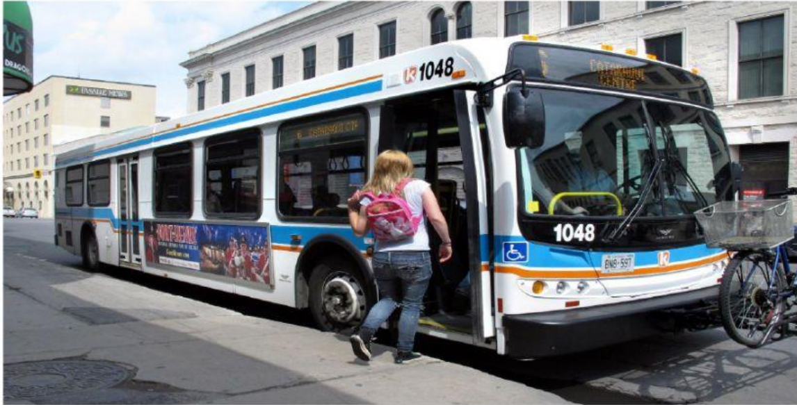
The bus / come