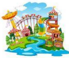
Park / funfair