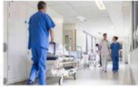
hospital / school