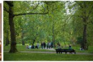
park / police station