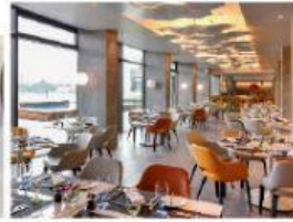
restaurant / museum