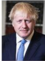
British prime minister