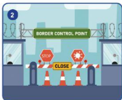
Closure of borders