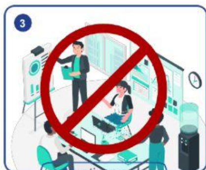
Meetings are prohibited