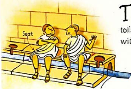
Water flowed along this channel into a drain.