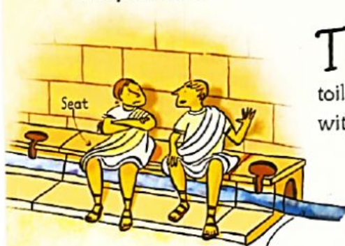
Water flowed along this channel into a drain.