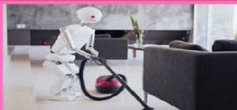
ROBOTS - CLEAN