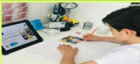
STUDENTS – GO TO SCHOOL