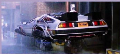
CARS - FLY

Look at the pictures and write your predictions for 2050.