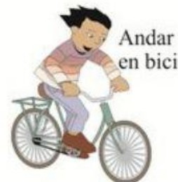
Andar en bici