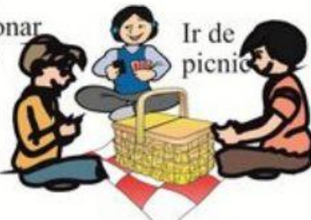
Ir de picnic