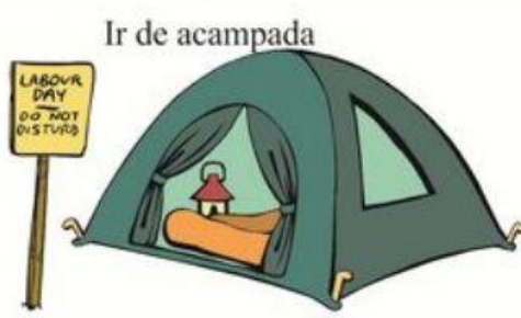
Ir de acampada