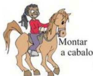
Montar a cabalo