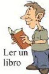
Ler un libro