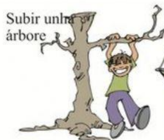
Subir unha árbore

FALL COLLECT SHELLS CLIMB A TREE JUMP HAVE A REST PAINT LISTEN TO MUSIC GO CAMPING GO FOR A PICNIC TAKE PHOTOGRAPHS ROW SWIM PLANT RIDE A HORSE FISH WALK PICK MUSHROOMS CYCLE SUNBATHE READ A BOOK RUN PLAY GARDEN DO EXERCISES