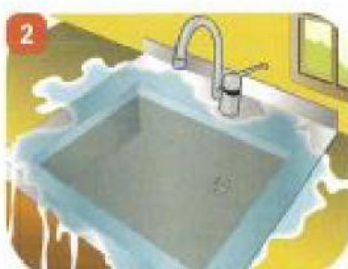
unclog the sink