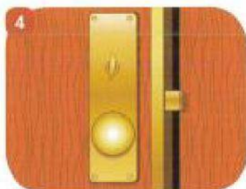
fix the lock