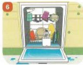
repair the dishwasher