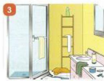
clean the bathroom