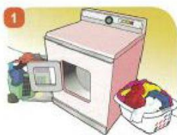
fix the dryer

Look at the pictures. Write the questions to complete the conversations. Make requests with Can, Could, Will or Would.