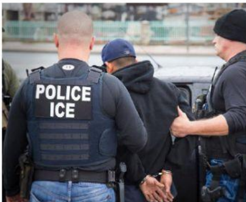
ICE: U.S. Immigration and Customs Enforcement