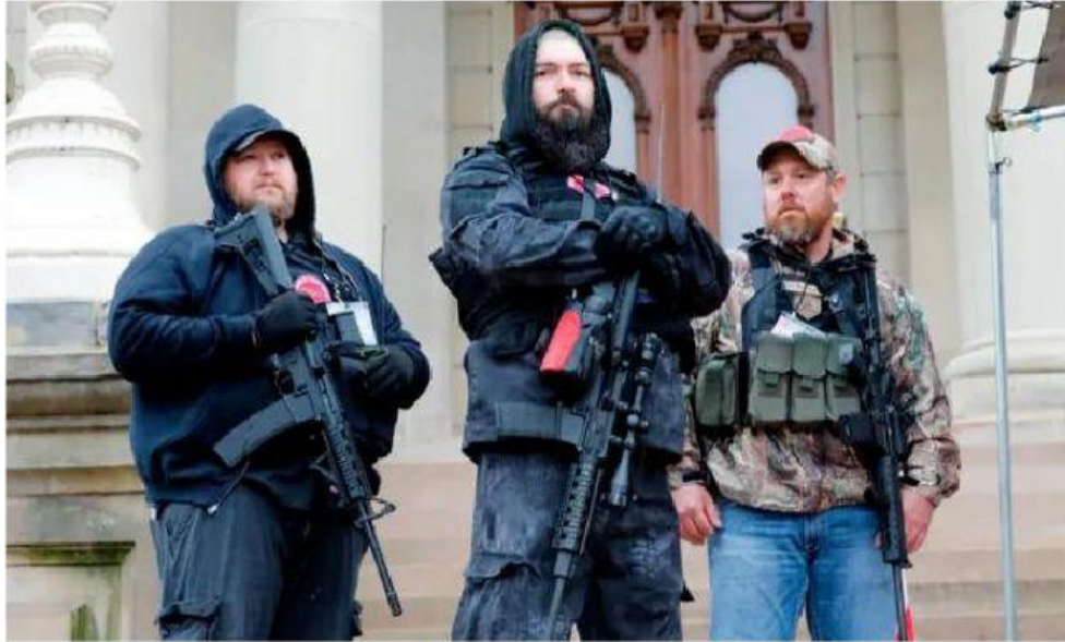
Armed protesters take part in rally on 30 April at the Michigan state capitol in Lansing, demanding the reopening of businesses shut as an anti-coronavirus measure.