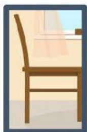
IT'S A CHAIR.