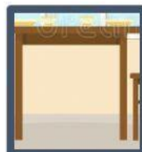
IT'S A TABLE.