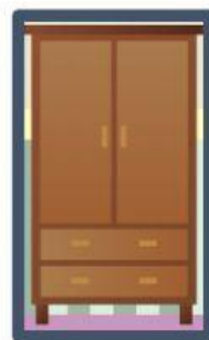
IT'S A WARDROBE.