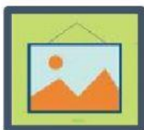
IT'S A PICTURE.