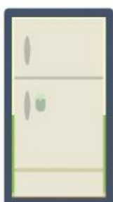
IT'S A FRIDGE.