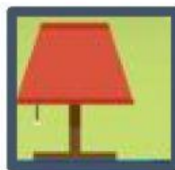
IT'S A LAMP.