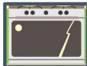
IT'S A COOKER.