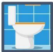
IT'S A TOILET.