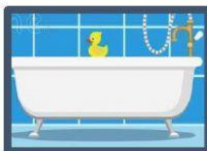
IT'S A BATHTUB.