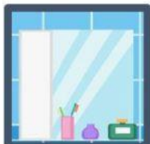
IT'S A MIRROR.