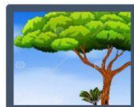
IT'S A TREE.