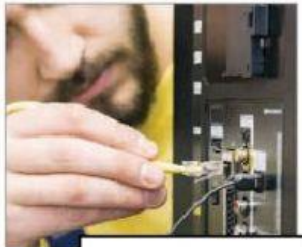
3. He cable service.