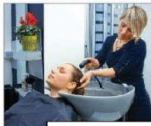
4. She a customer's hair.