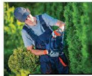
5. He hedges.