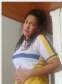
She has a stomachache