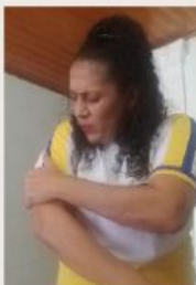
She has a sore arm