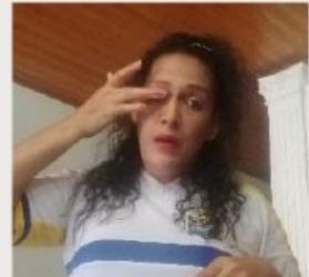
She has a sore eyes