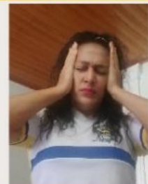
She has a headache