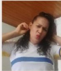
She has an earache