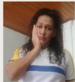
She has a toothache