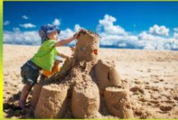
Making a sandcastle