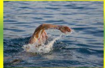
Swimming in the sea