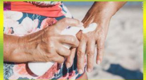
Putting on sun cream