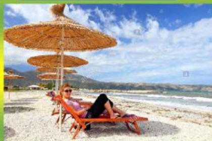
Lying in the shade