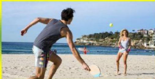
Playing with a ball and ball