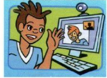
USE A WEBCAM