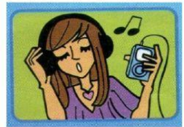
LISTEN TO AN MP3 PLAYER