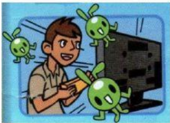
PLAY COMPUTER GAMES