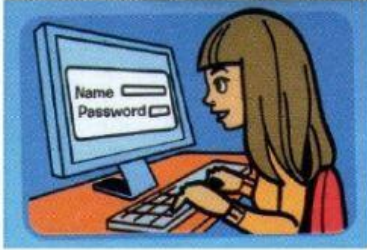
LOG IN TO A COMPUTER

1) Look at the pictures and say the words.