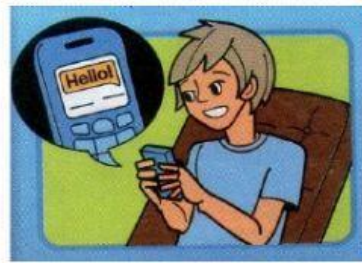
WRITE TEXT MESSAGES