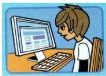
READ A WEB PAGE