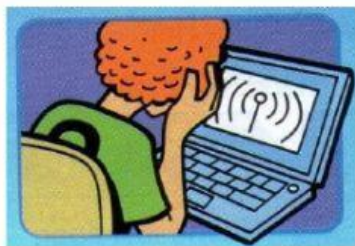
SURF THE INTERNET