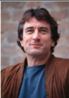
Robert De Niro