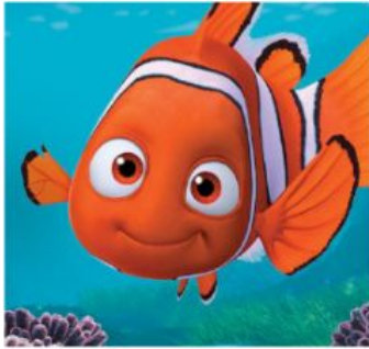
A fish named Nemo