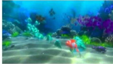
One day Nemo disobeys his father and gets lost from home.