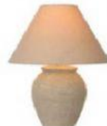
shelf cupboard lamp