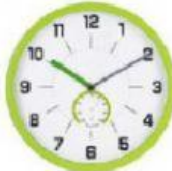
lamp shelf clock