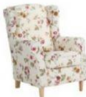
bed armchair shelf