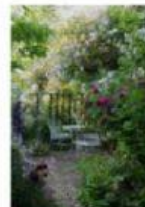
mirror garden sofa