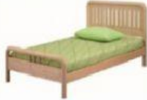
shelf bed desk