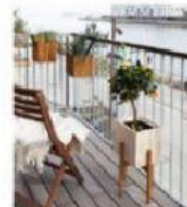
garden house balcony