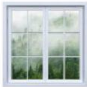
clock window cupboard