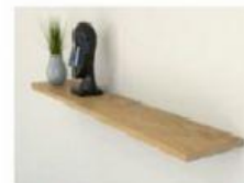
cupboard shelf sofa