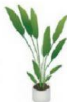
garden plant balcony