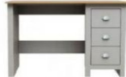
desk window door