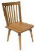
sofa chair shelf