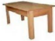
armchair clock table