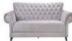
sofa chair armchair