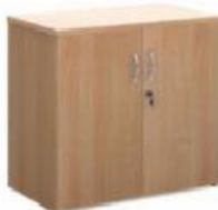
board cupboard armchair