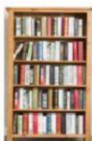
plant fireplace bookcase