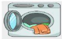
1. W _____