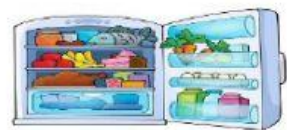
3. F _____